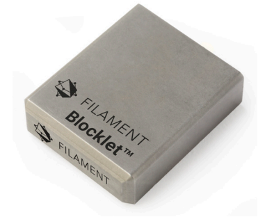
BLOCKLET USB DEVICE

During an installation pairing-process, the Blocklet USB device and supported host permanently bond, thereby establishing an immutable unique identity for the combined devices. The bonding enables supported configurations to engage in sensitive transactions requiring uncompromised device identification and digital signatures. Attempts to use a Blocklet USB device with any host other than the host the USB device was originally bonded with will be unsuccessful. Finally, USB device applications include, but are not limited to, digital asset verification and transfer operations such as traditional Blockchain, Ethereum, etc. – i.e. secure digital repository applications generally referred to as Digital Ledger applications.